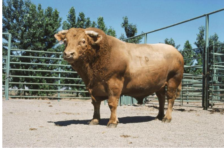
A beefalo bull