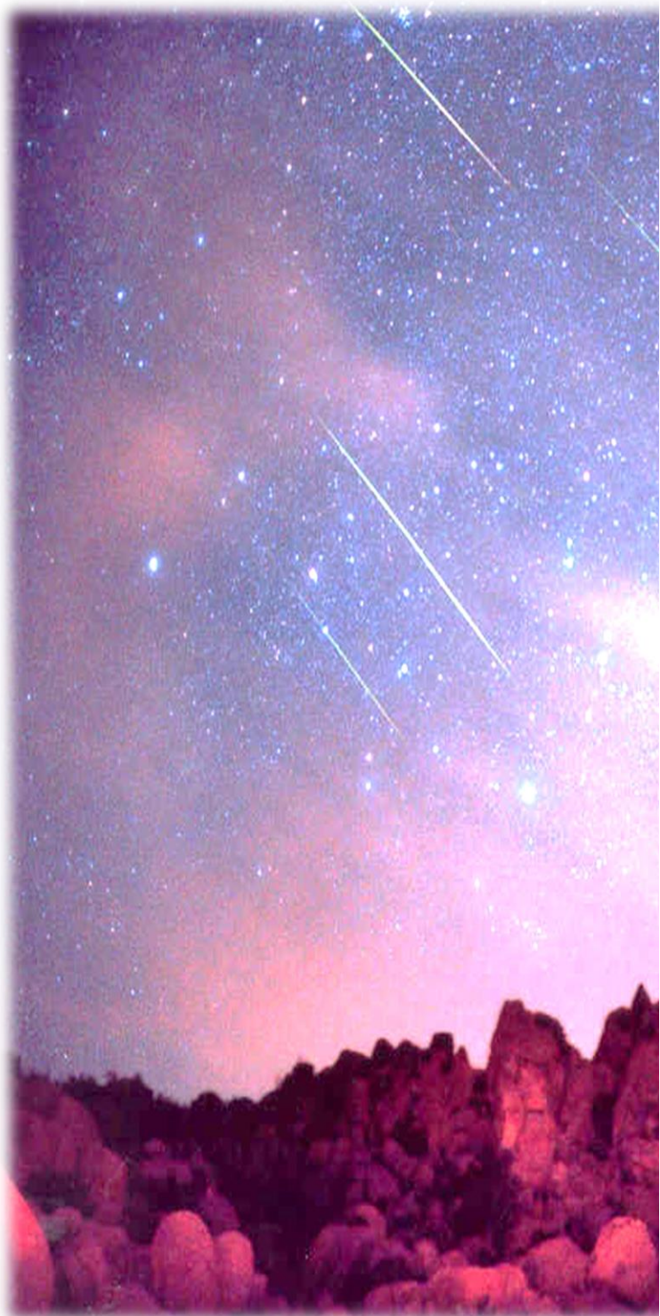
Meteor shower, Joshua Tree CA